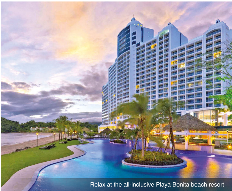
Relax at the all-inclusive Playa Bonita beach resort

DAY 6 Azuero Peninsula – Hacienda San Isidro – Playa Bonita: Today’s adventure begins with an excursion to the Hacienda San Isidro where Ron Abuelo Rum and Seco Herrerano (considered the national drink) are made by the Varela Hermanos. Learn how a small sugar cane mill grew into one of the country’s leading liquor manufacturers. Almost 100 years later, the traditions continue as the world’s most awarded Panamanian rum and Seco Herrerano are produced. Of course the visit wouldn’t be complete without a sampling of the famous products!