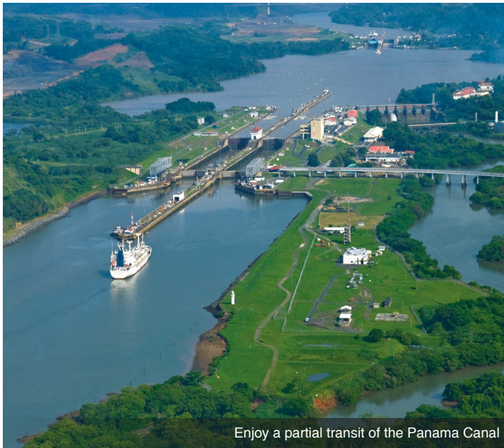
Enjoy a partial transit of the Panama Canal