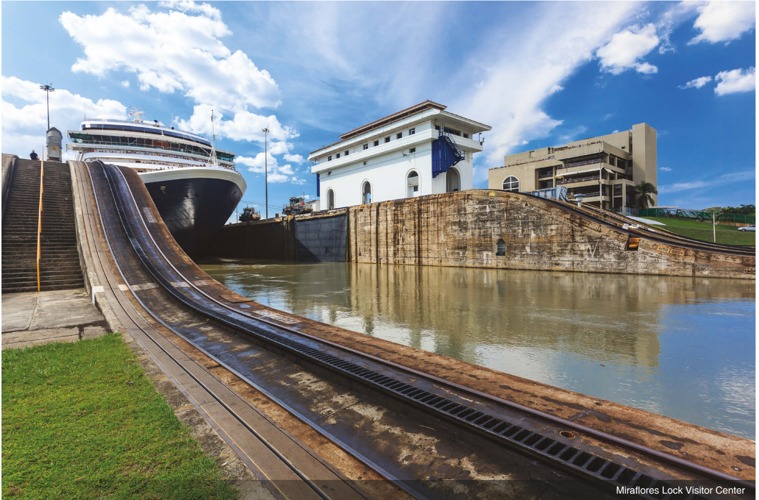
Miraflores Lock Visitor Center