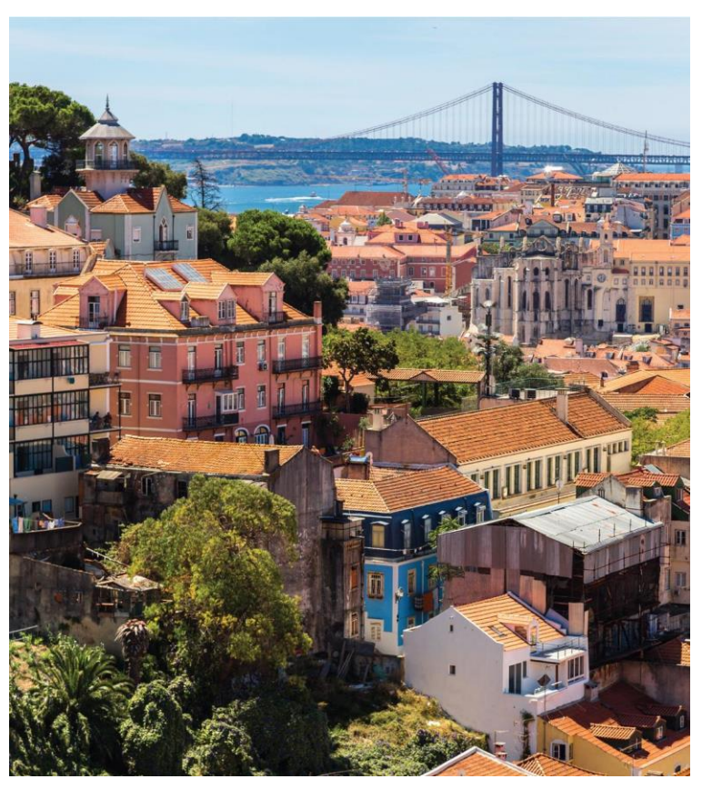
10 Days ● 13 Meals: 8 Breakfasts, 2 Lunches, 3 Dinners

HIGHLIGHTS... Portuguese Riviera, Lisbon, Belém, Obidos, Sintra, Choice on Tour, Arraiolos, Cork Factory, Evora, Winery Visit, Alentejo, Monsaraz, Lagos, Algarve, Faro, Tavira, 4 UNESCO World Heritage Sites, Azeitao