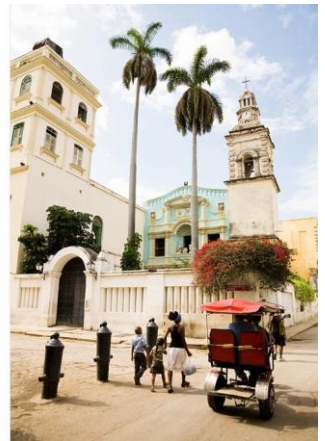
8 Days ● 16 Meals: 7 Breakfasts, 3 Lunches, 6 Dinners